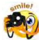
Photo information was sent home today. If you would like to order, please follow the instructions on the form. If you have any issues ordering, please don't hesitate to come in and see us. School photo day is Tuesday 12 th October.